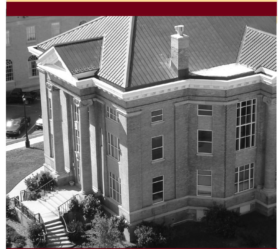
James B. Garland Municipal Business Center